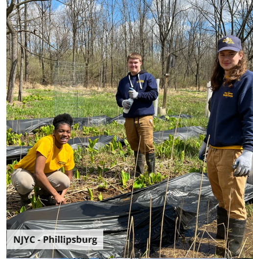
NJYC - Phillipsburg