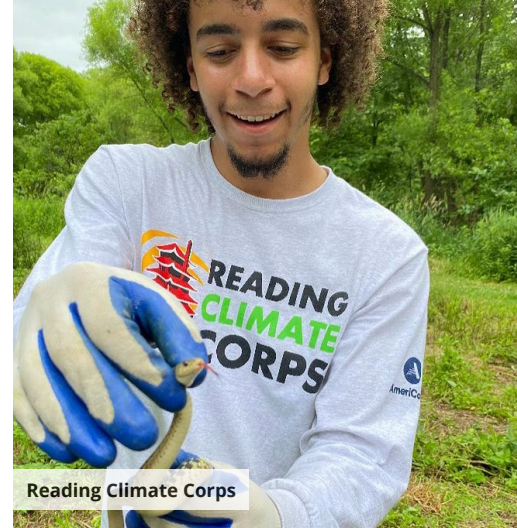
Reading Climate Corps