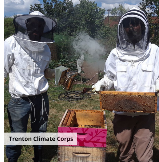
Trenton Climate Corps